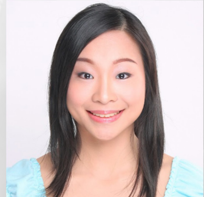
MBBS (HK), MRCPCH (UK), MRCPCH (HK), DCH (UK), DCH (HK), DTM&H (LSTM), FHKCPaed, FHKAM (Paed)